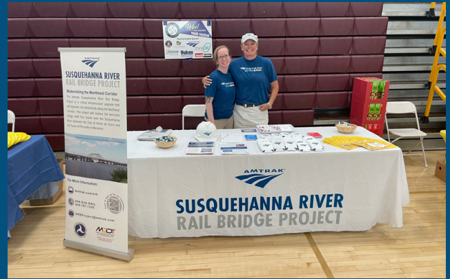
On August 17, Amtrak supported the Havre de Grace Youth Commission's Refuel for School Event.