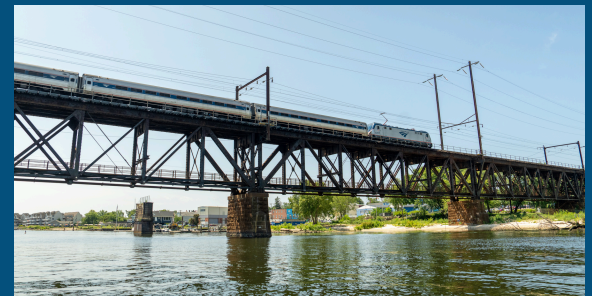
Amtrak train crossing the Susquehanna River.

As part of the environmental permitting process, Amtrak will be hosting a public hearing in partnership with the Maryland Department of the Environment. The hearing will take place at 6:00 PM on September 19, 2024, at the Havre de Grace Activity Center. A poster session will take place from 6:00 to 6:30 PM followed by a public hearing in accordance with the Joint Permit Application regulations. Public comments will be accepted during the hearing.