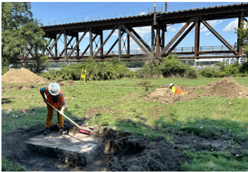
The team performing excavation as part of planned archeological investigations.

As part of the environmental review process, Amtrak completed archaeological studies in 2014 using documentary sources to identify areas with potential for archaeological deposits. In August 2024, Amtrak and its contractors conducted supplemental archaeological surveys in Havre de Grace and Perryville to further investigate the archeological context and sensitivity at potential sites within the project area. The team completed digs in thirteen locations and are preparing technical reports that will be reviewed by the Maryland Historical Trust. Should items of interest be found, Amtrak will adhere to procedures outlined in the Programmatic Agreement .