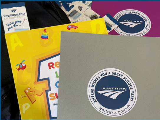
Amtrak donated school supplies to students at Perryville Public Schools to help them prepare for the upcoming school year.

The Project Team had the opportunity to support students in the City of Havre de Grace and the Town of Perryville as they begin this upcoming school year. On August 17, 2024, Amtrak was a headliner sponsor at the Refuel for School Youth Festival in Havre de Grace. Amtrak supported the donation of 400 bags of school supplies and hosted an outreach table at the event. The Project Team also partnered with Perryville Public Schools to donate school supplies and backpacks to set students up for success. Cheers to a wonderful school year!