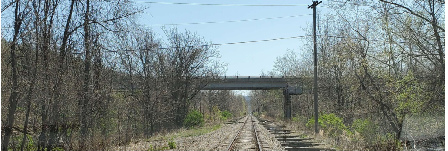
MP 84.72 PA191 OH Bridge