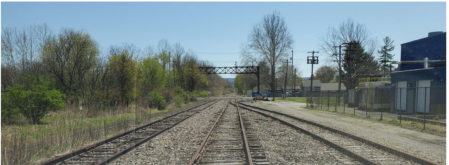
MP 83.3 Gravel Siding East End Switch & Boiler Siding