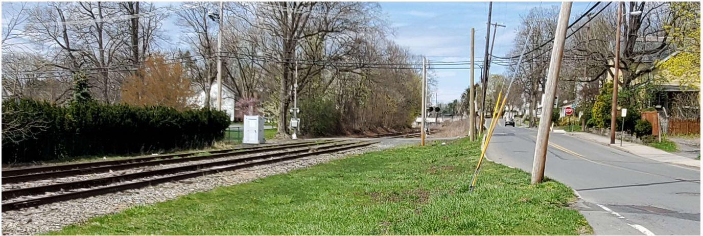
MP 81.93 Broad St Crossing looking West