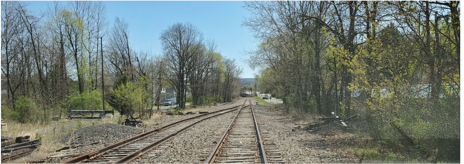
MP 82.44 Boiler Siding East End Switch