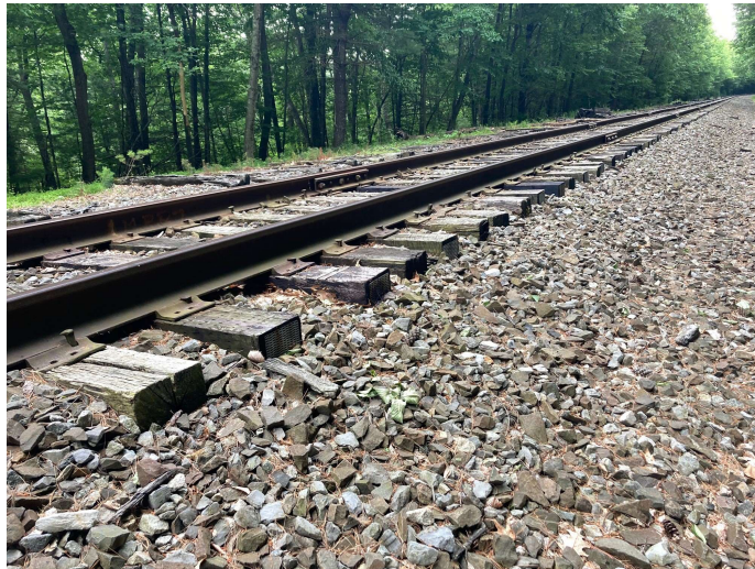
MP 87 Marker