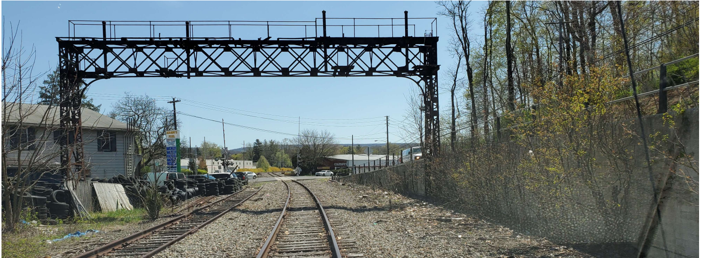
MP 82.4 Approaching Courtland St Crossing looking East