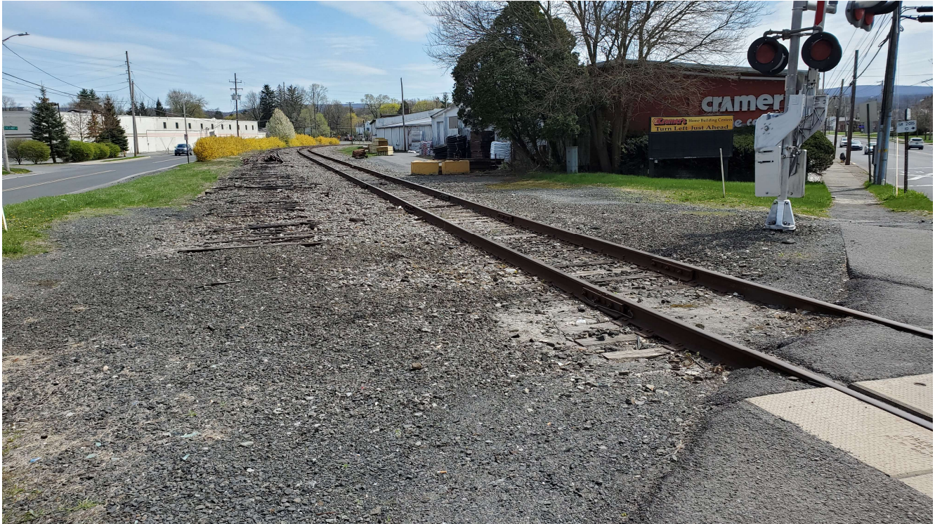
MP 82.32 Courtland St Crossing looking East