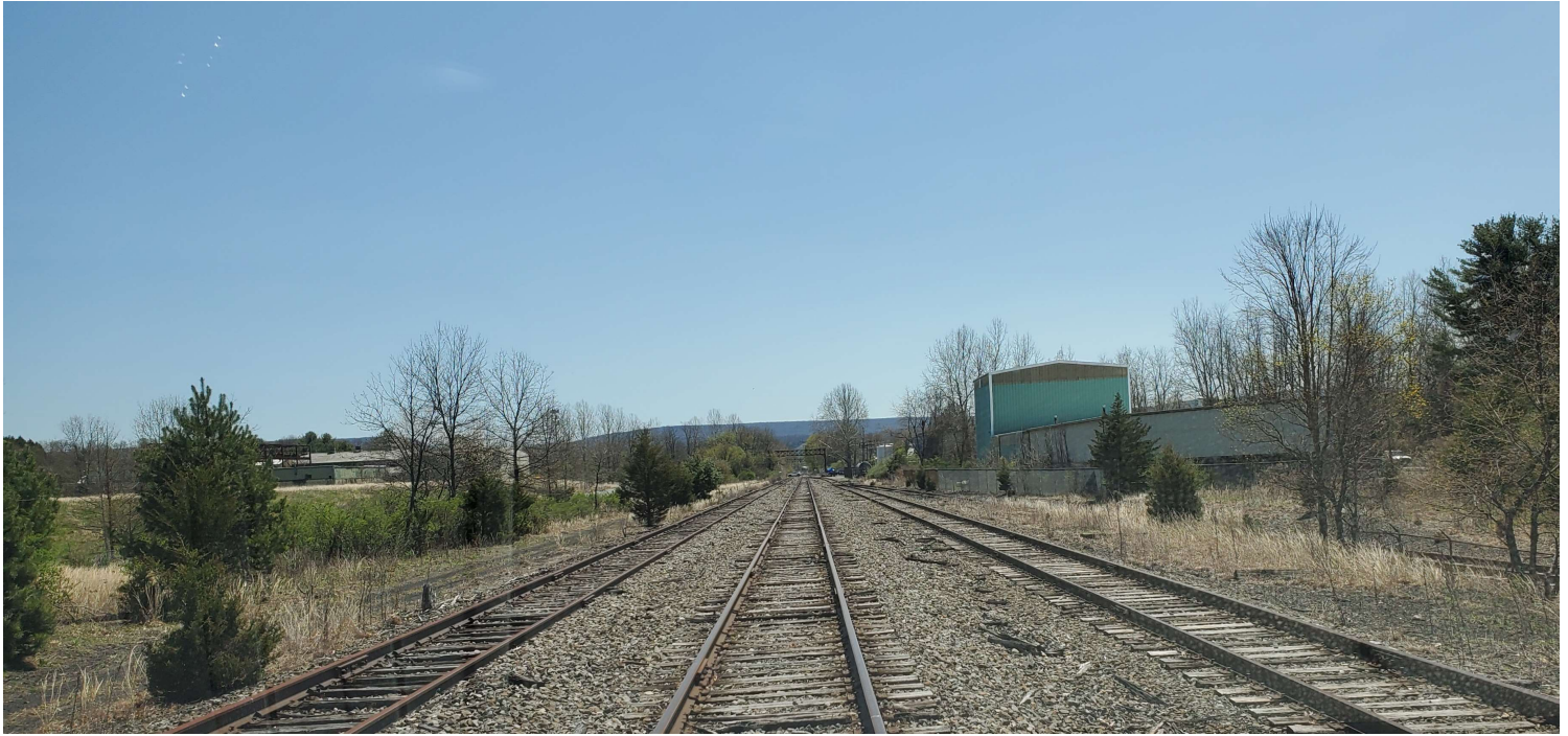
MP 83.5 Gravel Siding & Boiler Siding