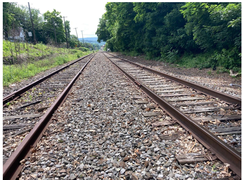
MP 82.0 looking East