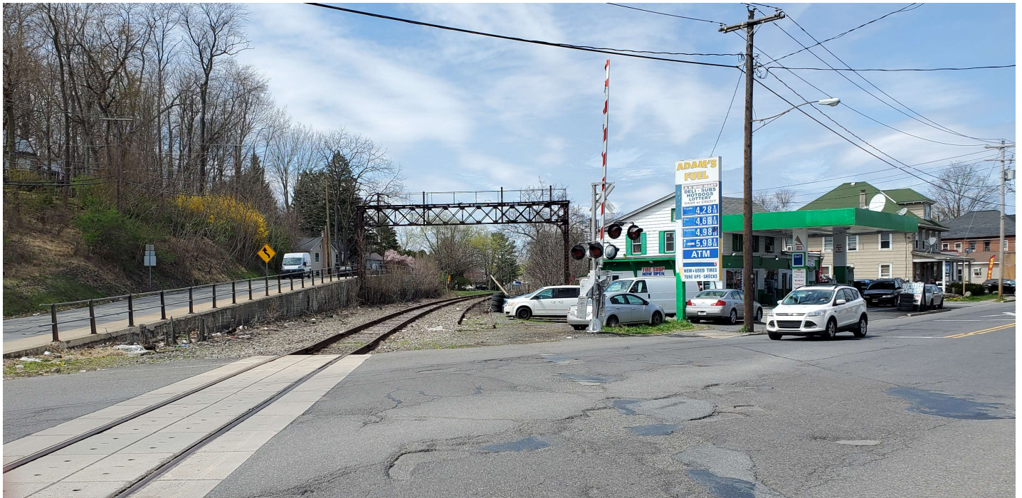
MP 82.32 Courtland St Crossing looking West