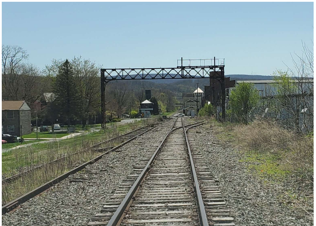
MP 81.85 Hughes Siding Switch (looking East)