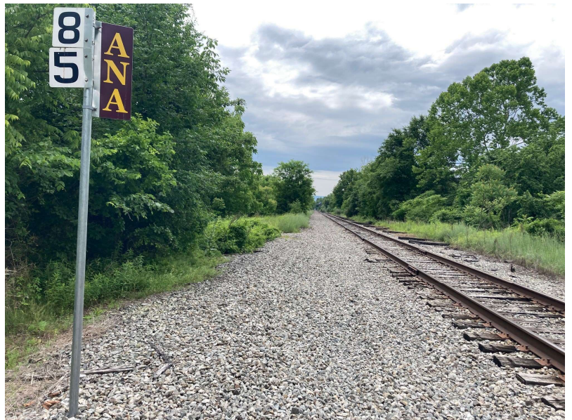
MP 85 & Block Station ANA Marker