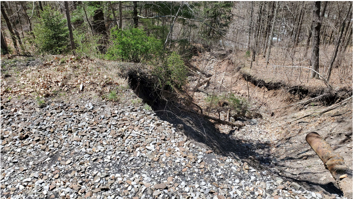
MP 89.00 Washout