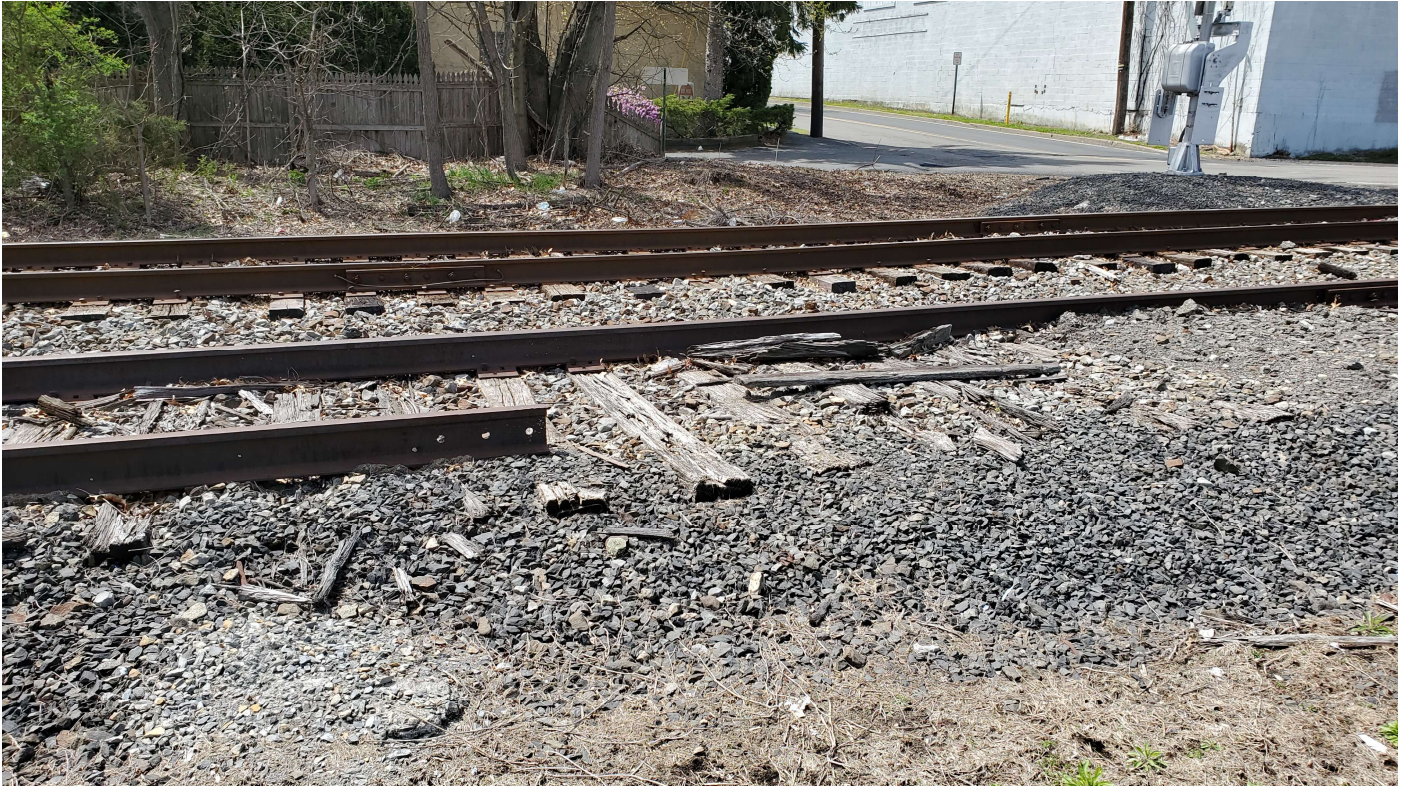
MP 82.15 Burson St Crossing