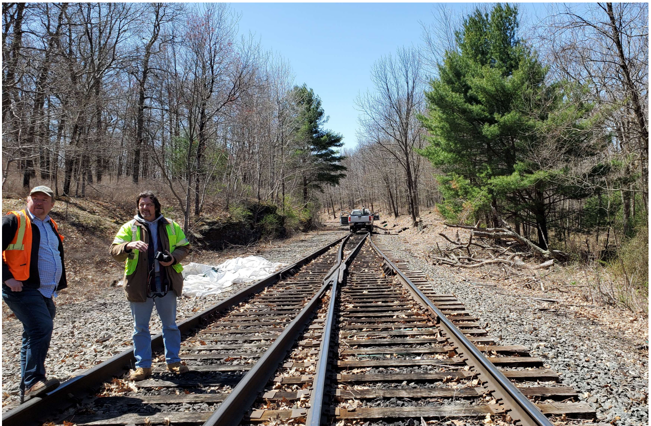
MP 94.15 Bestway Switch