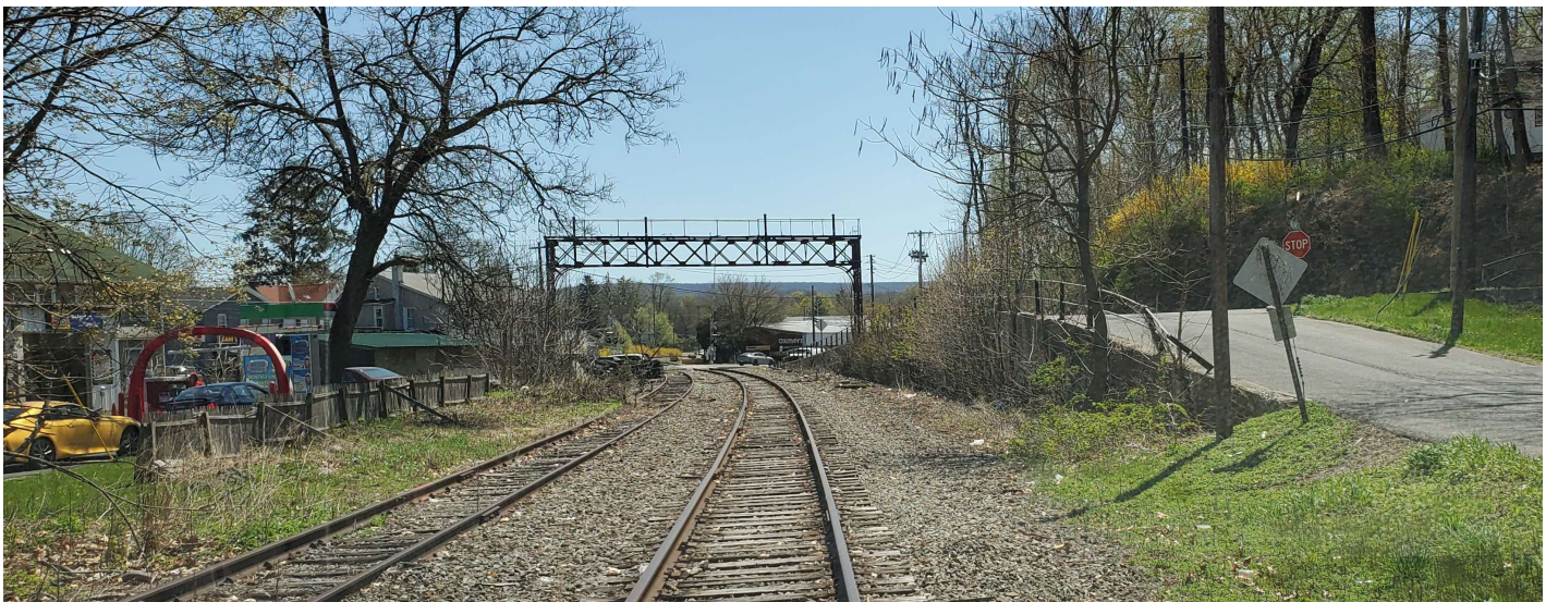
MP 82.5 Approaching Courtland St Crossing looking East