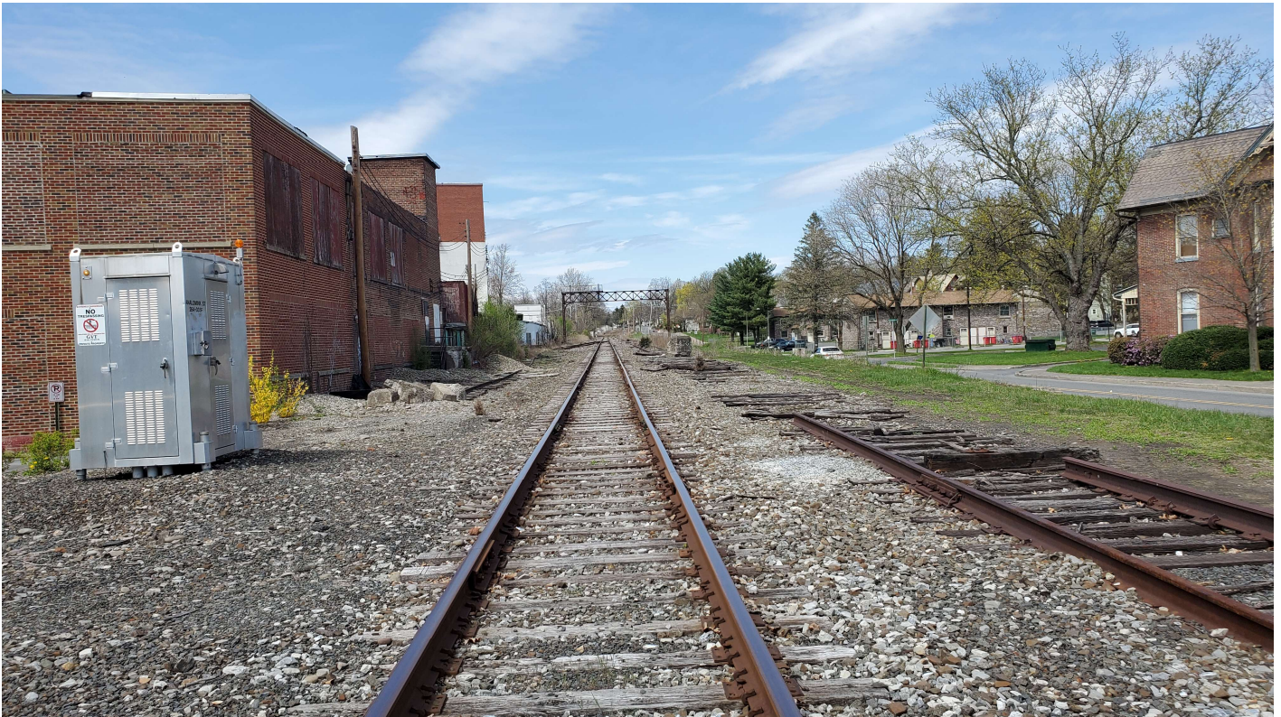
MP 81.75 Approaching Analomink St Crossing (looking West) with Hughes Siding Stub (on left)