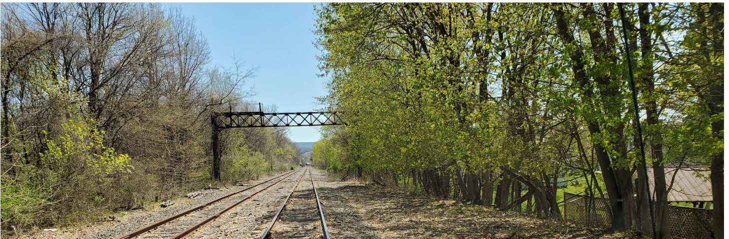
MP 83.00 Boiler Siding