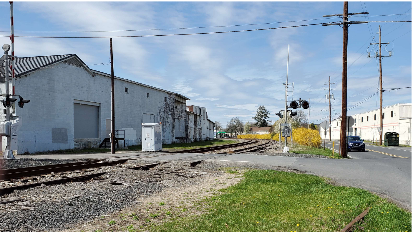
MP 82.15 Burson St Crossing looking West