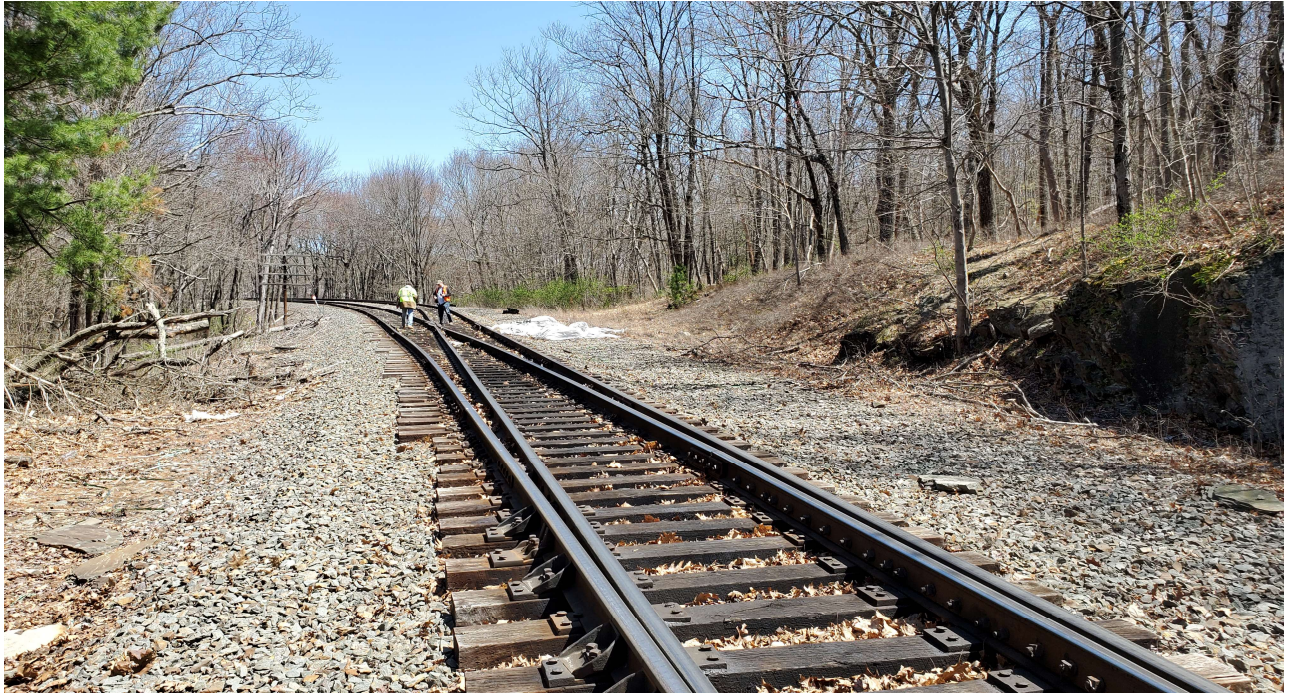
MP 94.15 Bestway Switch