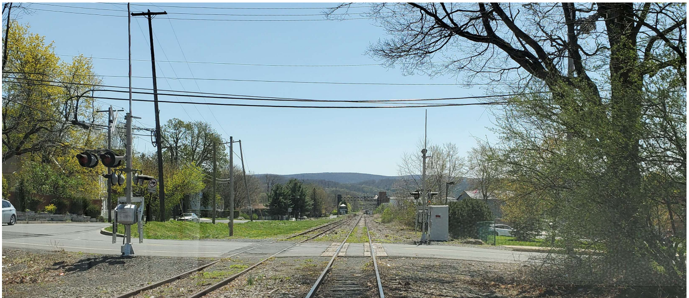
MP 81.93 Broad St Crossing looking East