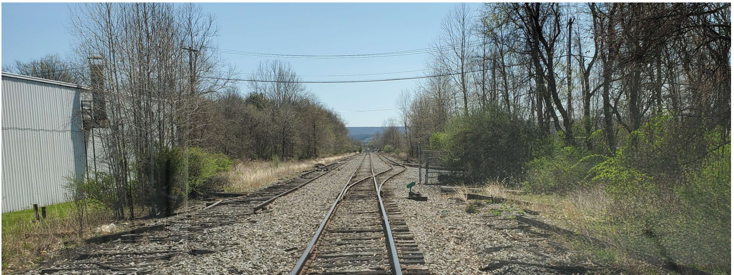
MP 83.85 Gravel Siding West End Switch & Boiler Siding