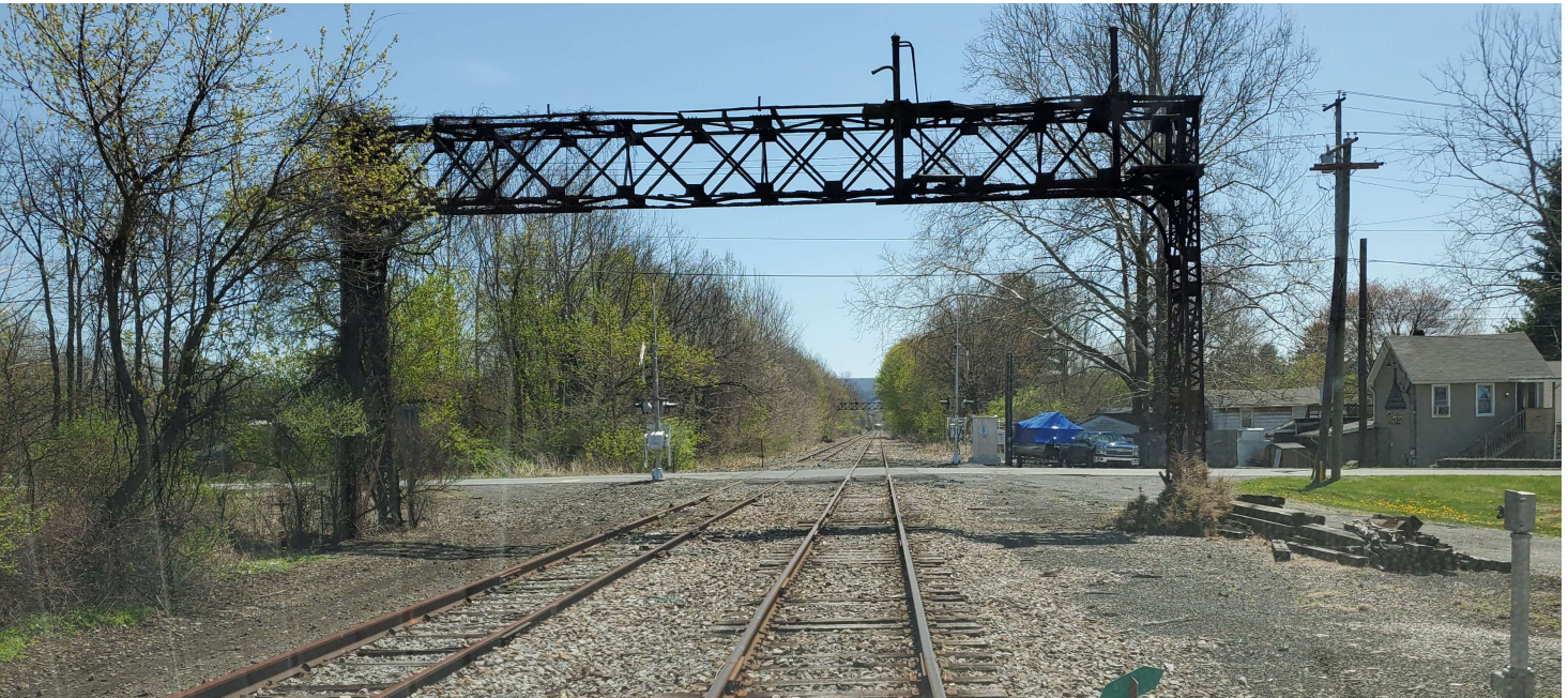
MP 83.21 Mill Creek Rd Crossing & Boiler Siding