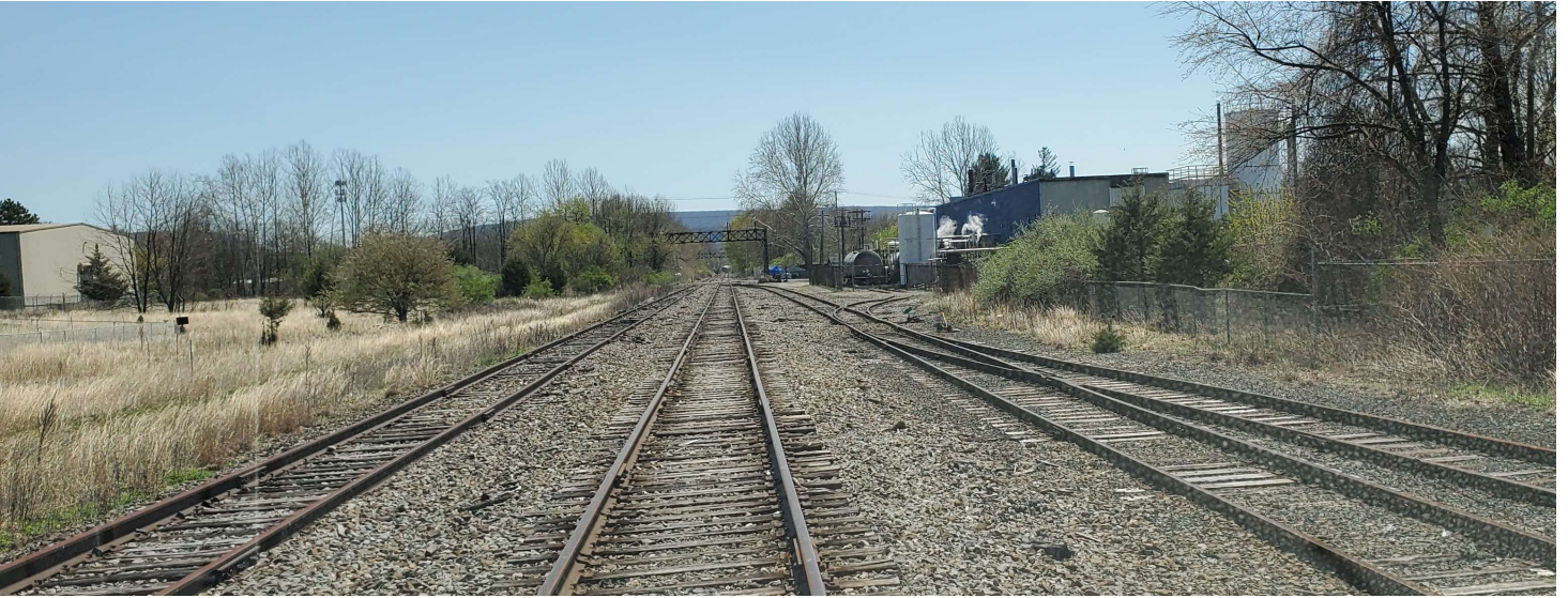
MP 83.4 Gravel Siding & Boiler Siding