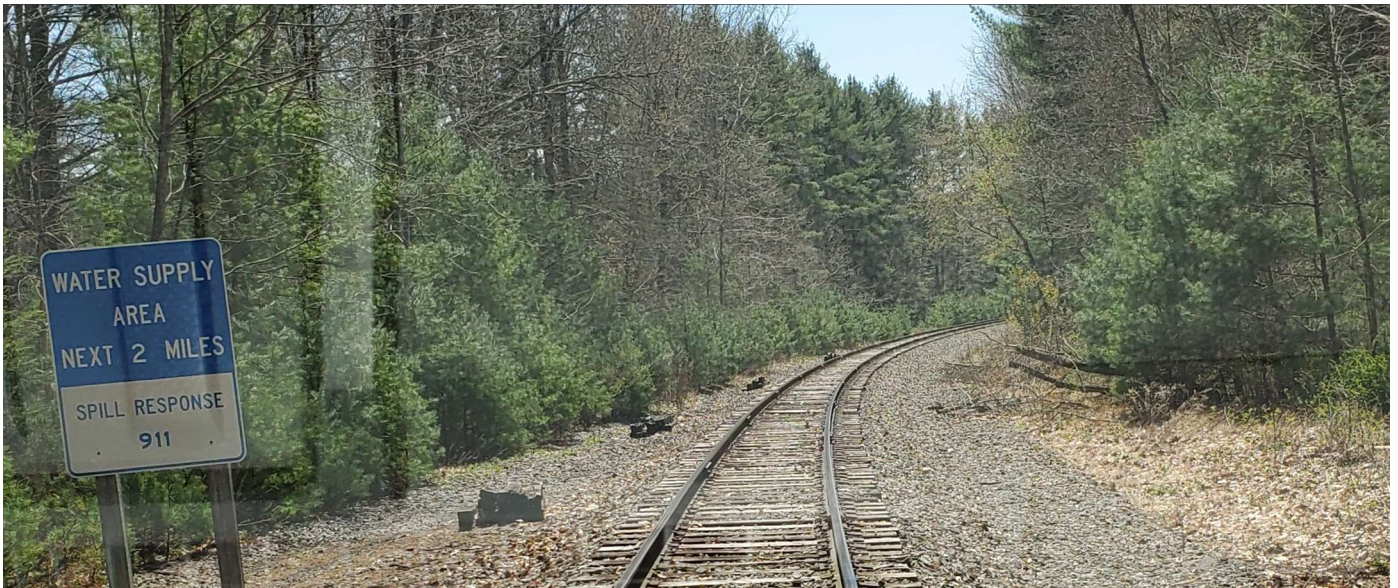
MP 87.00 Watershed Notice