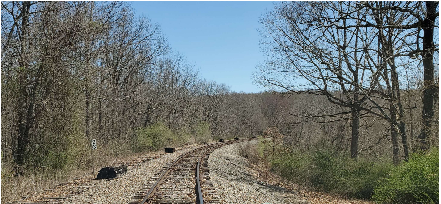
MP 93 Marker