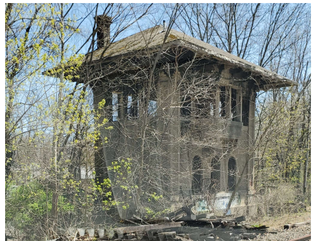
MP 83.11 Gravel Place Tower