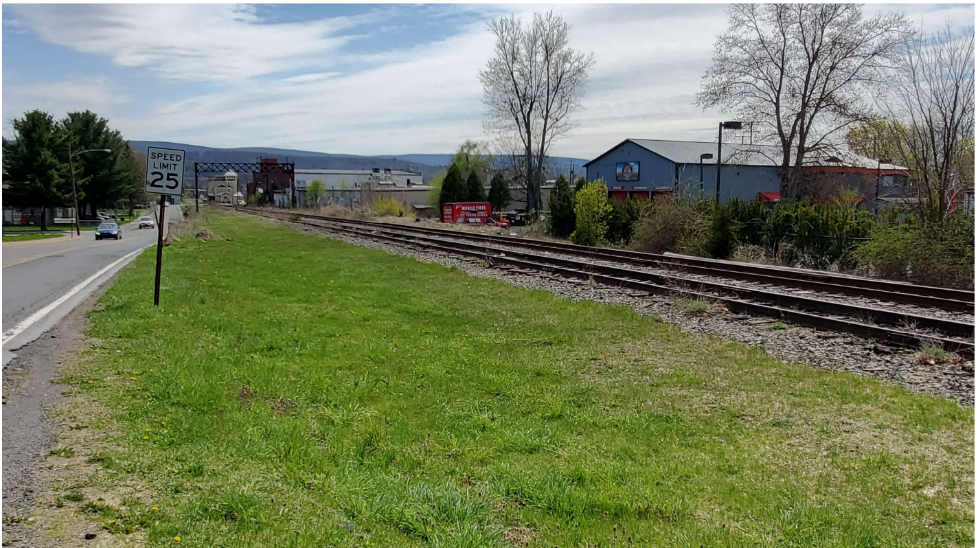
MP 81.90 Looking East