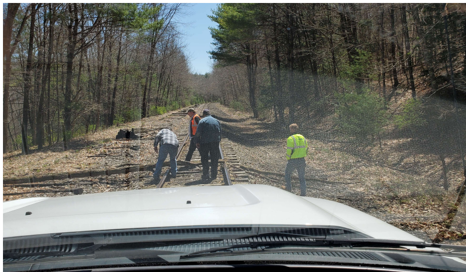
MP 87.5 Clearing Downed Tree