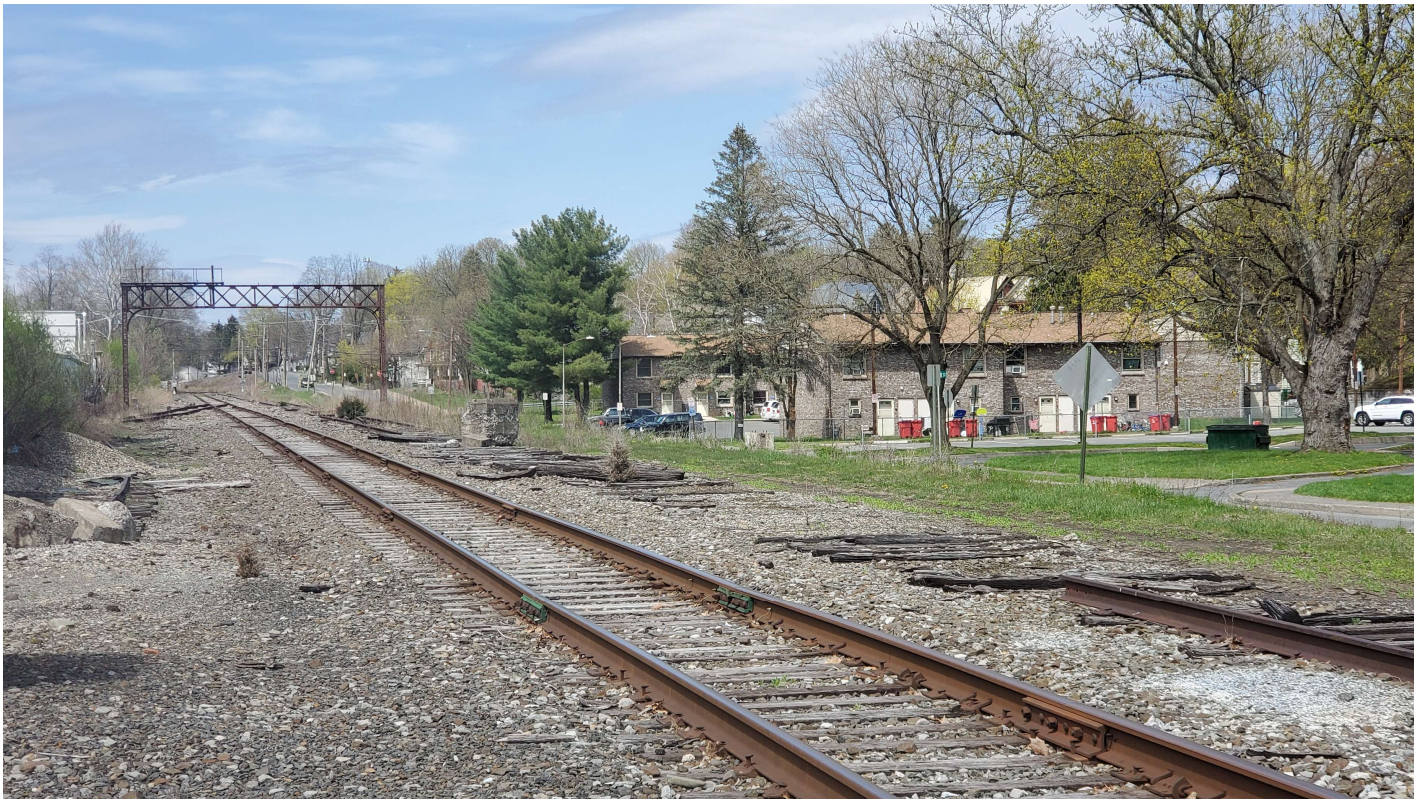
MP 81.87 Looking West