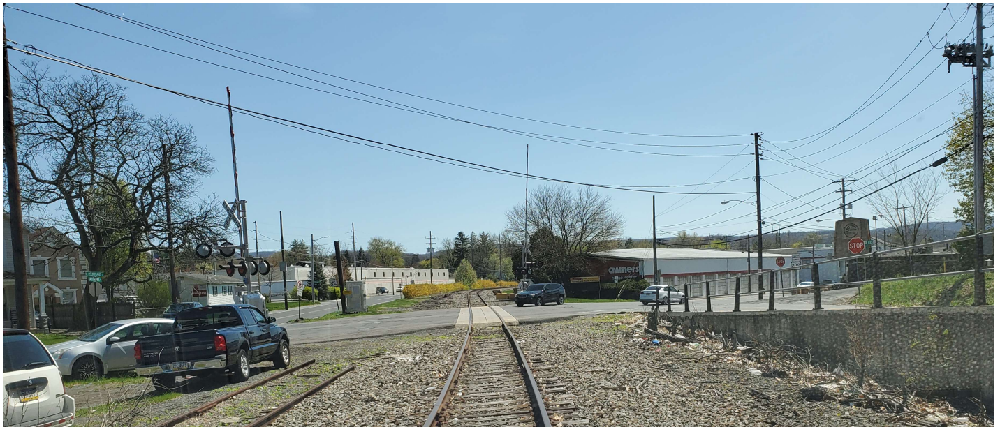
MP 82.32 Courtland St Crossing looking East