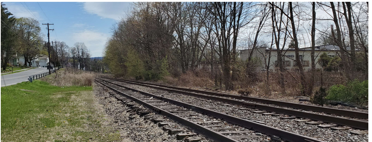
MP 82.5 looking West