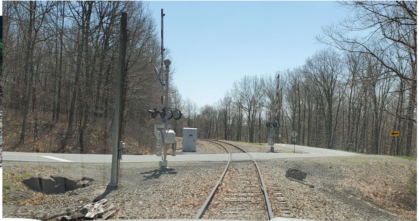
MP 92.27 Henrys Rd Crossing