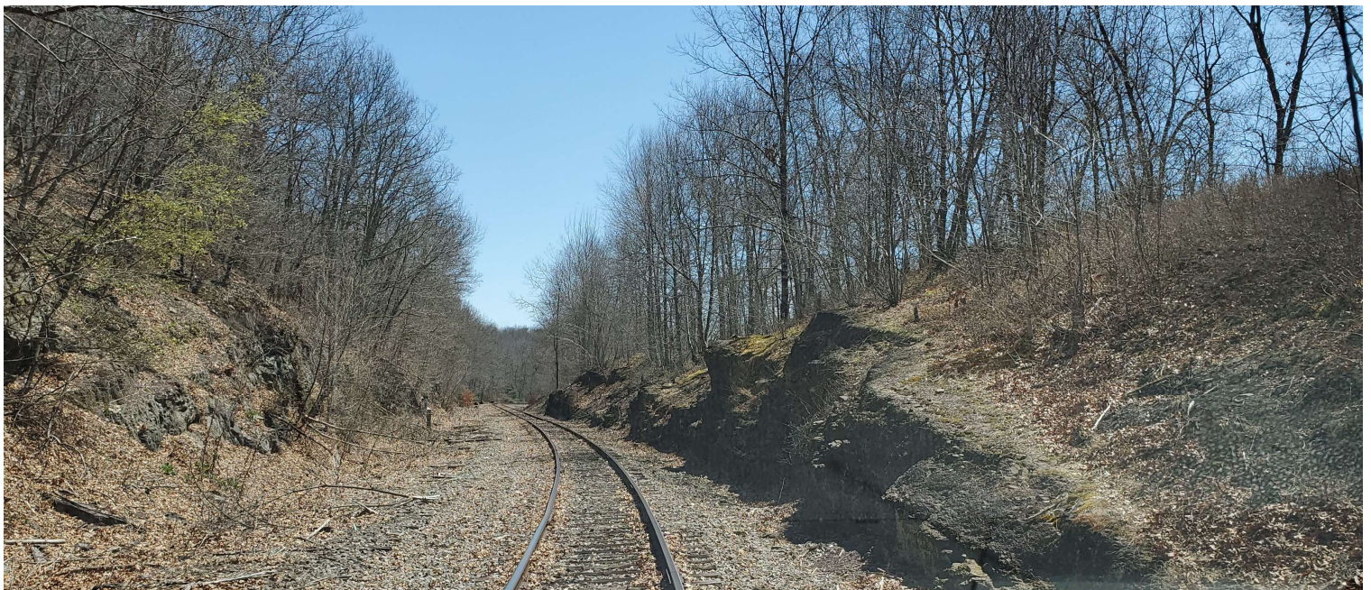
MP 92 Marker & Rock Cut