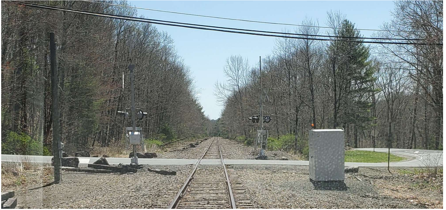
MP 90.17 Brown Hill Rd