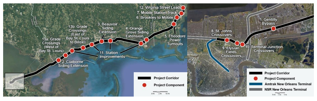
Figure 10: Map of Project components