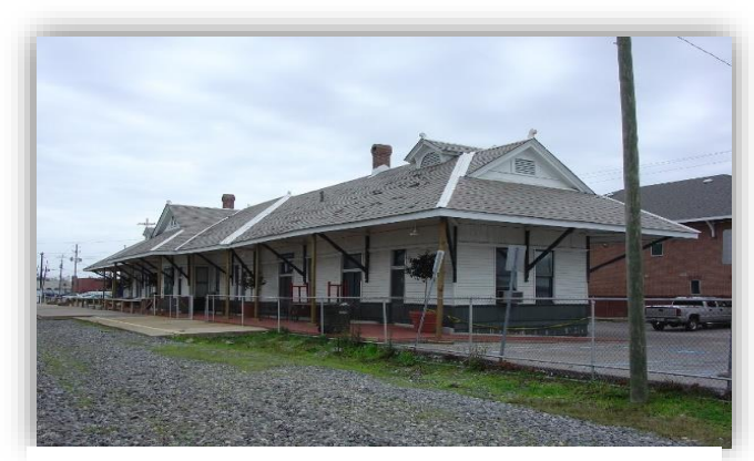
Figure 4: The old Pascagoula, MS Station, no longer in operation

Pascagoula, MS Station : A shelter will likely be deployed, in close proximity to the former Pascagoula station, which is currently leased to another party and not used as a train station. Amtrak may try to acquire the former station from the property owner. The train depot in Pascagoula was built in 1904 and added to the National Register of Historic Places in the 1970s, and in recent years has been used as an art gallery.<sup>6</sup> A platform canopy will be constructed.