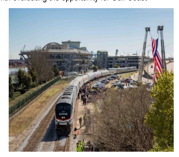
Figure 2: Amtrak demonstration train in Mobile, AL in 2016

In addition to ending Sunset Limited service after 2005, Hurricane Katrina highlighted that the Gulf Coast region is particularly vulnerable to environmental challenges and weather-related damage and in desperate need of multiple modes of emergency egress. Regional leaders are determined to build transportation resiliency to avoid repeating the disastrous evacuation of New Orleans when the next major hurricane strikes, and this new intercity passenger rail service could provide that resiliency. Additionally, the region as a whole faces the challenge of choice—with no passenger rail offered, communities have become dependent solely on car or (limited and declining) bus travel. Auto travel is expensive, time-consuming, and carbon intensive for Gulf Coast residents. Rebuilding passenger rail service, with an improved structure, will increase individual mobility, create jobs, improve the quality of life, and bring transportation options back to communities impacted by Katrina. This will in turn attract more businesses and visitors, creating a cycle of growth.