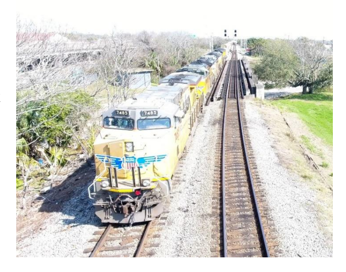
Figure 3: A UP train on NS Tracks on the Back Belt

Component #8: St. Johns Crossovers – This component will install new universal crossover north of Bayou St. John, near Mile Post (MP) 5.2, on the NSR between Main Track 1 and Main Track 2, allowing Amtrak trains entering and exiting the New Orleans Union Passenger Terminal to utilize Main Track 1 more often, and reducing the risk of delays from freight trains waiting to enter Oliver Yard on Main Track 2. The crossovers will use four #15 turnouts with 136-pound (per yard) rail with dual control switch machines constructed on pads adjacent to the main tracks and slid into position during a track shutdown. Work will include a new signal bungalow, two 2 track cantilever signals and a backup generator located in a separate bungalow. The scope of this Project component is NEPA (Track 2), preliminary engineering (Track 2), final design and construction (Track 3). NSR will manage and lead the scope of work for this component.