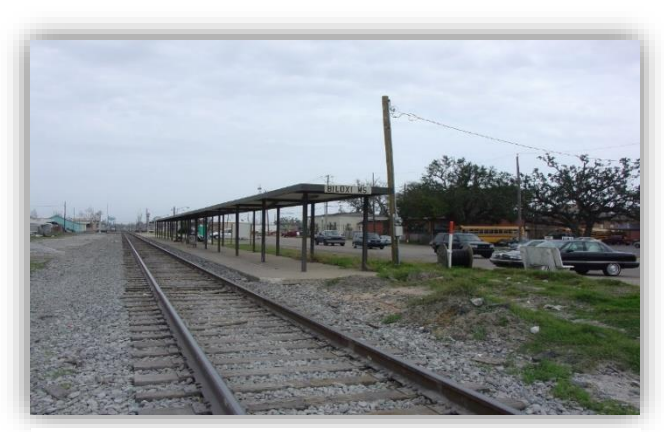
Figure 5: Bixoli, MS Station Canopy

Mobile, AL Station: A new platform will be constructed.