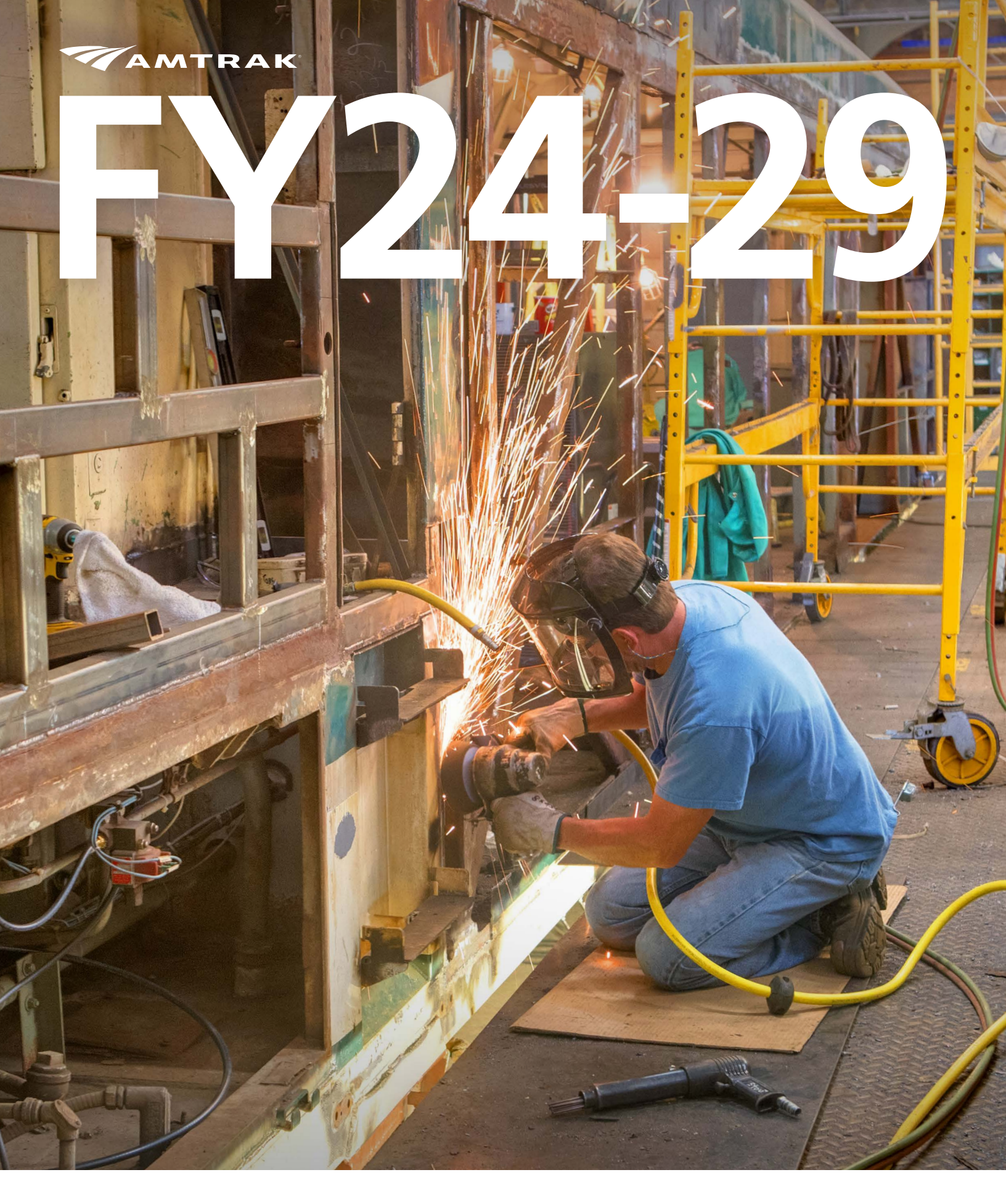
Equipment Asset Line Appendices