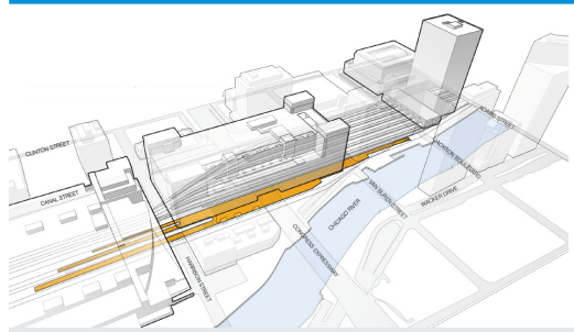
CUS Mail Platform (shown in orange)

(PE) PRELIMINARY ENGINEERING, NEPA, (FD) FINAL DESIGN/FINAL ENGINEERING, (C) CONSTRUCTION