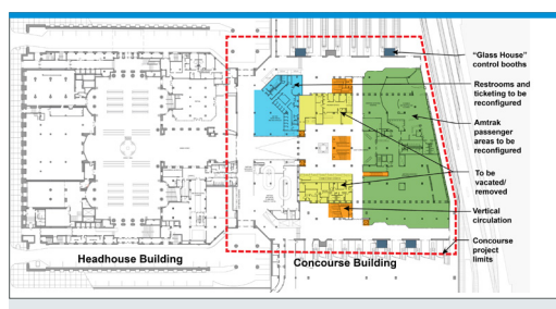
CUS Concourse Improvements

U.S. Senate Majority Whip Dick Durbin (D-IL)