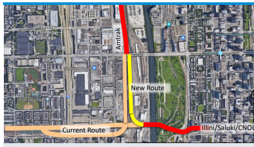
Connection between CUS and SCAL