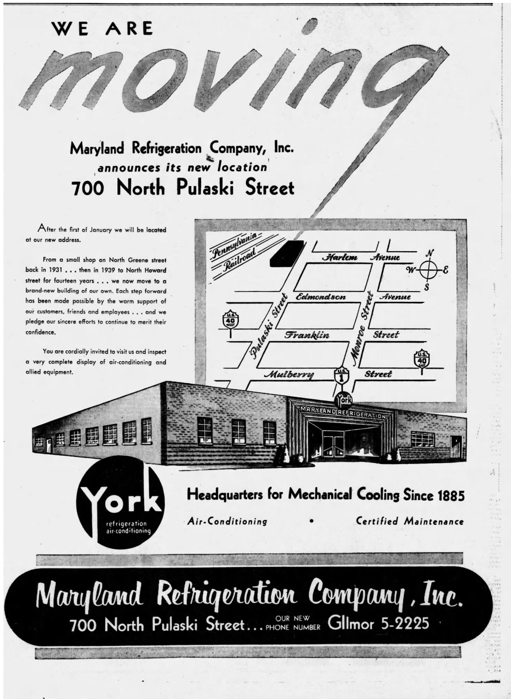
Figure 1. Maryland Refrigeration Co., Inc. "We Are Moving." Advertisement. The Evening Sun (Baltimore), 31 December 1953. https://www.newspapers.com , accessed 25 April 2023.