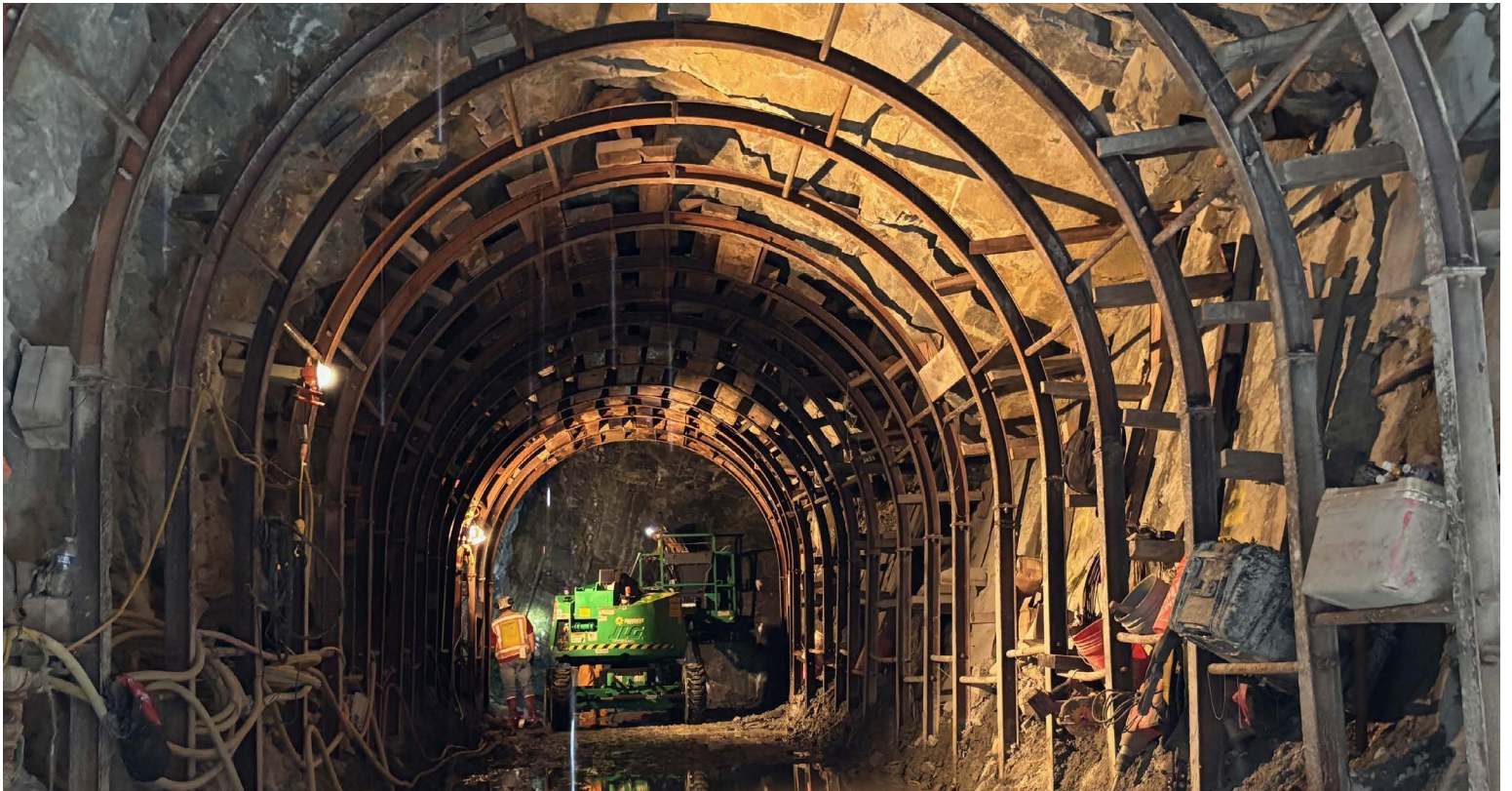
Inside the Utility Siphon Tunnel