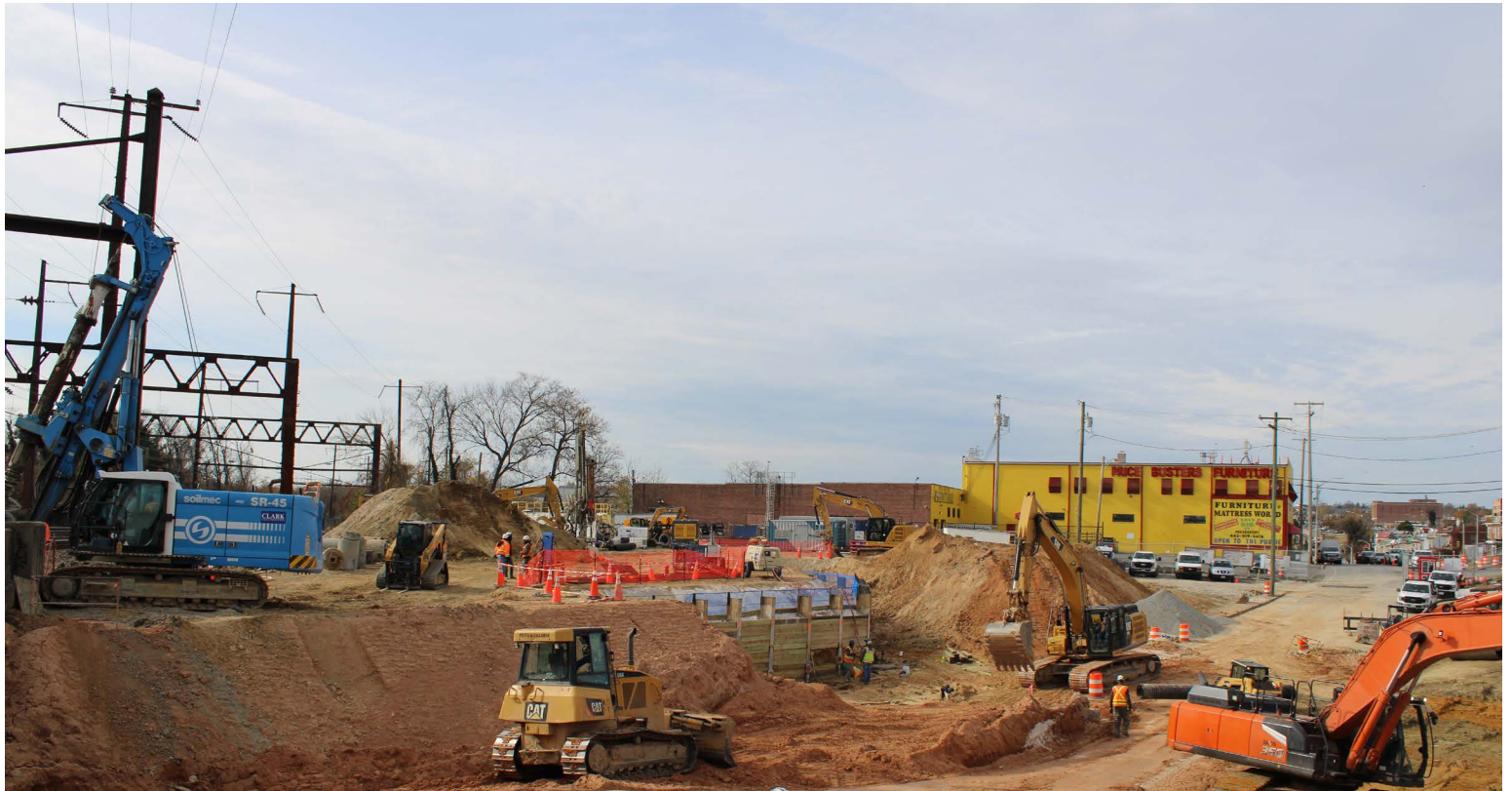
W Mulberry Street Bridge Construction Site