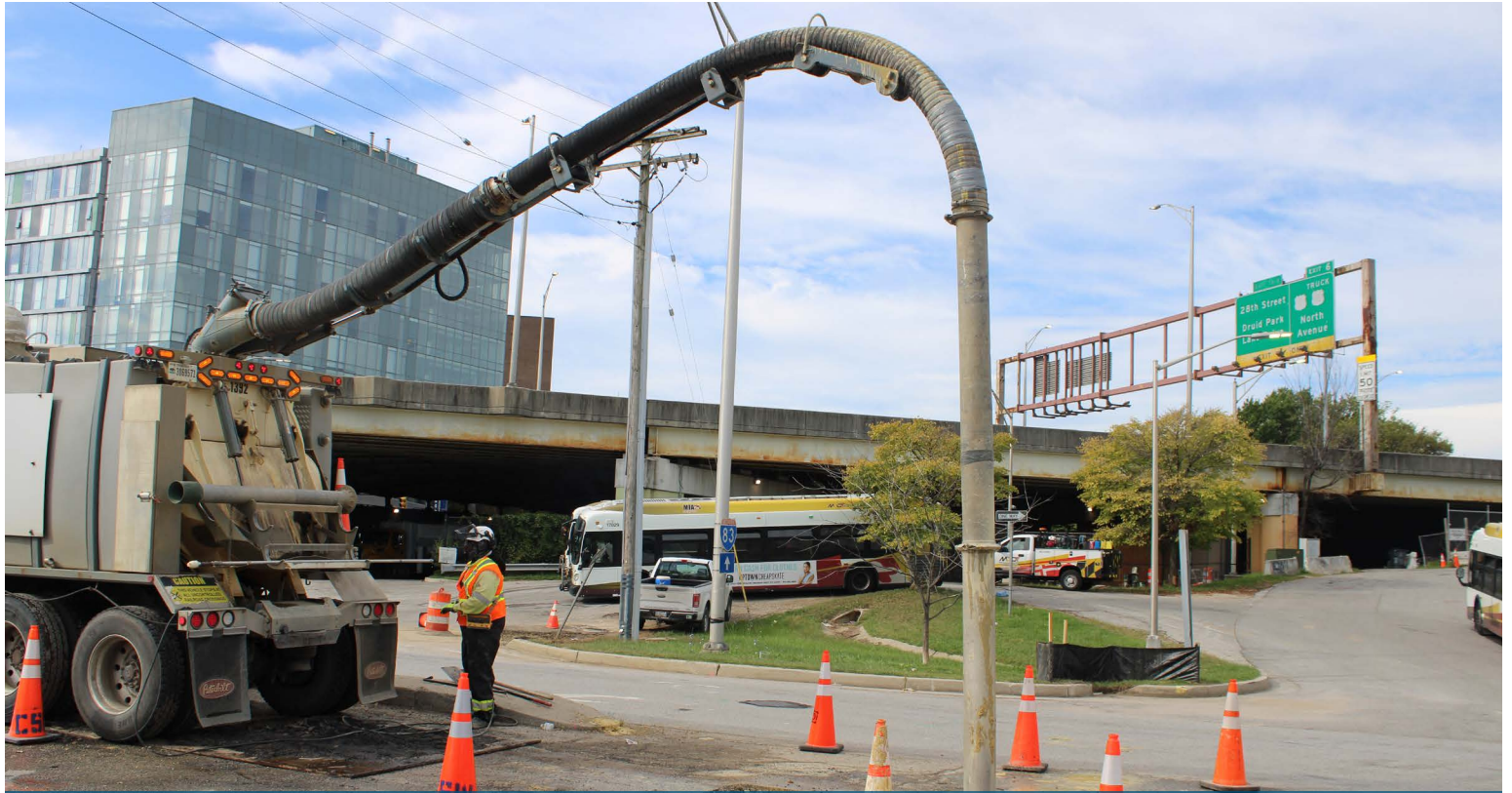
Utility Installations and Median Shifts on McMechen Street Driveway