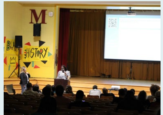
The presentations for both the March and May bi-monthly meetings are available on the Community Outreach section of the Program website, Amtrak.com/FDTunnel .