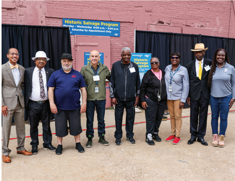
Community and team members celebrate the Historic Salvage Program launch

Program. The Salvage program collected, catalogued and then made available household items and building materials for members of the Greater Rosemont and Midtown Edmondson communities. This work allows us to keep items like marble stoops, stone windowsills, doors, bathtubs, and washing machines out of landfills.