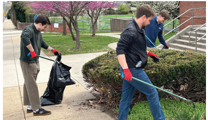
Requity Foundation Inc. Community Cleanup

We look forward to collaborating with you! Contact us at (443) 423-1115 or email fdtunnel@amtrak.com to let us know how we can offer our support.