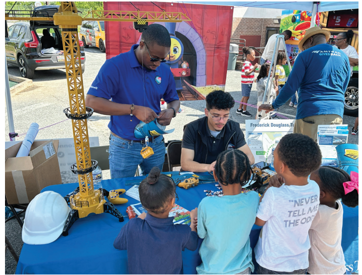
Mary Ann Winterling Elementary School Art in the Park

We're excited to connect with even more community members as the weather continues to warm up. If you're a member of an organization located in West Baltimore, we'd love to attend your next event or meeting. Please contact us at (443) 423-1115 or email fdtunnel@amtrak.com to let us know how we can be a good neighbor to you!