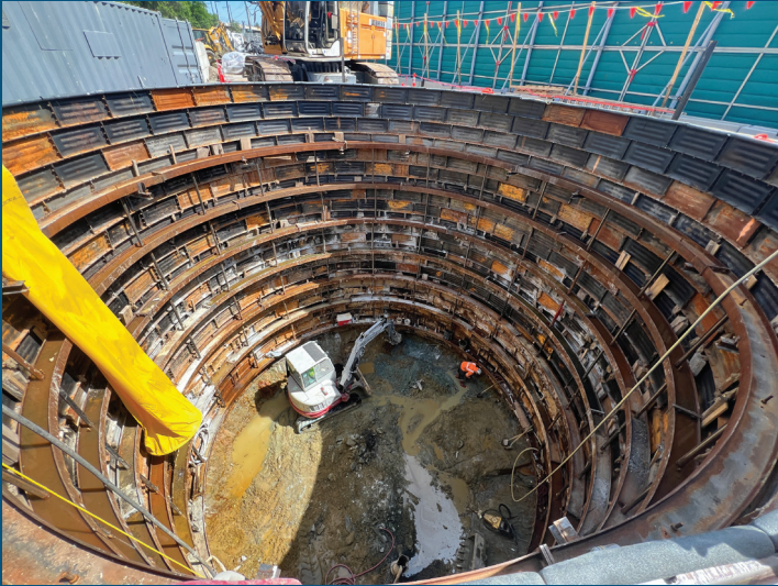
Utility siphon tunnel site

The Program outreach team is increasing our onsite presence as construction advances. We continue to coordinate with our partners within Baltimore City government and local utility companies so that we complete necessary utility relocations. Preconstruction inspections and site surveys are still available for eligible property owners, to inspect current conditions at individual properties.