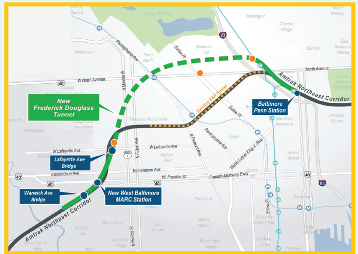
Frederick Douglass Tunnel Program Alignment