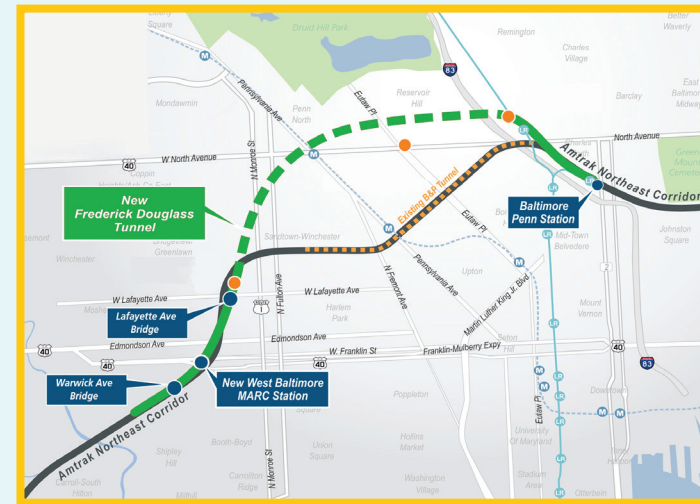
Frederick Douglass Tunnel Program Alignment